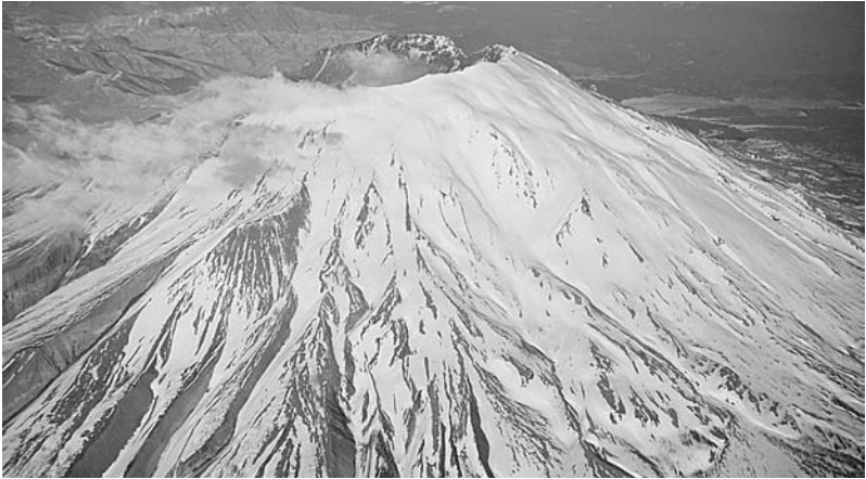
A lot of volcanic activity would be expected with such a cataclysm as the Flood.

temperature as horizontal movement of the tectonic plates accelerated. This would spill the seawater onto the land and cause massive flooding—perhaps what is aptly described as the breaking up of the 'fountains of the great deep' .