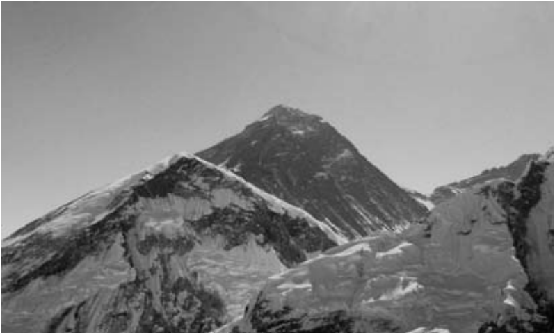
Even the high mountains of today have fossils of sea creatures near their peaks.

The collision of the tectonic plates would have pushed up mountain ranges also, especially towards the end of the Flood.